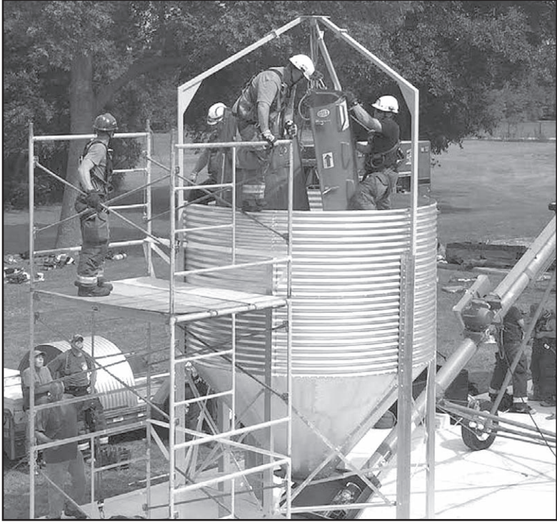
Firemen learn techniques to rescue those engulfed in a grain bin.