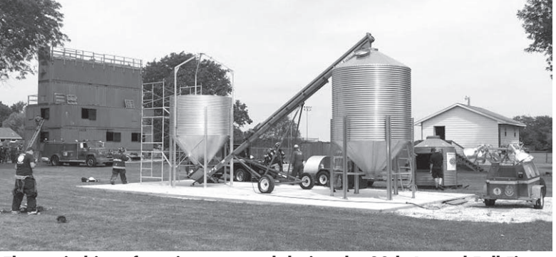
The grain bin safety site was used during the 20th Annual Fall Fire School held at the Galesburg Regional Fire Training Center. The KCFB Young Farmers and the Galesburg Fire Department worked together to construct the grain bin safety site using graciously donated funds.