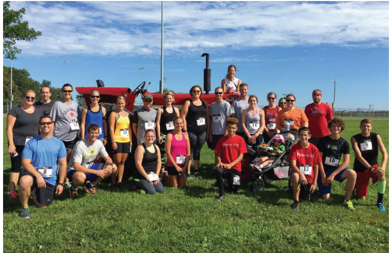
Participants gathered around the antique tractor before the Stampede 5K at Lake Storey.