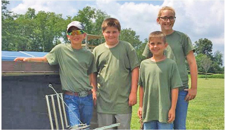
Beam & Co was the top youth team in this year's shoot, crushing 35 clays out of 100.