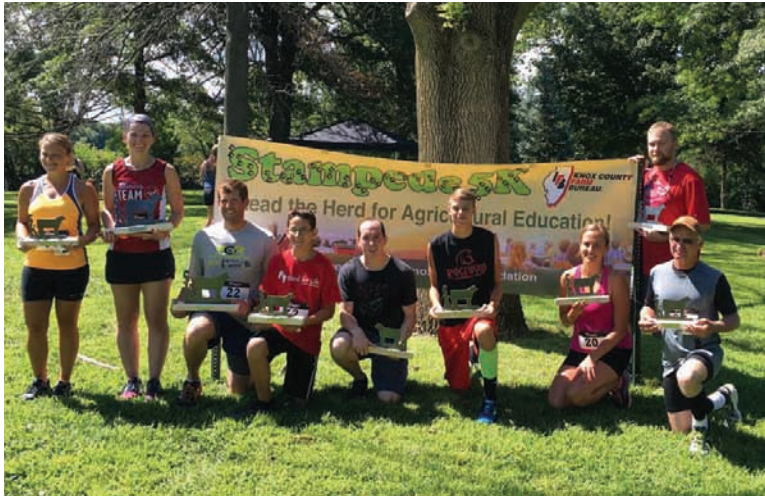
Congratulations to the overall race and age division winners of the Stampede 5K!

ROWVA FFA, Quality Awards, City of Galesburg, Road ID Safety Gear, and Stampede 5K volunteers.