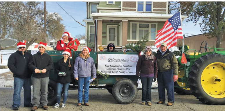
KCFB members participated in the 2015 Galesburg Holiday Parade to spread the word about the FARMLAND film viewing following the parade.

of a panel with leaders from various local agricultural organizations made the experience even more rewarding." After the panel discussion, the lucky door prize winners were drawn and the event came to an end. Even though the event only lasted one evening, the knowledge learned from watching the film farmland and participating in the panel discussion left a lasting impression on the importance of farming. Thank you to the event sponsors: Pilot Knob Comforts, Popcorn & Door Prize Donation Orpheum Theatre, Event Host Prairie Farms, Milk Donation Munson Hybrids, Water Donation Illinois Soybean Association Illinois Farm Bureau Illinois Farm Families Knox County Cattlemen's Association, Door Prize Donation Knox, Warren-Henderson Farm Families, Door Prize Donation Midwest Dairy Association, Door Prize Donation Knox County Pork Producers, Door Prize Donation Knox County Corn Growers Association