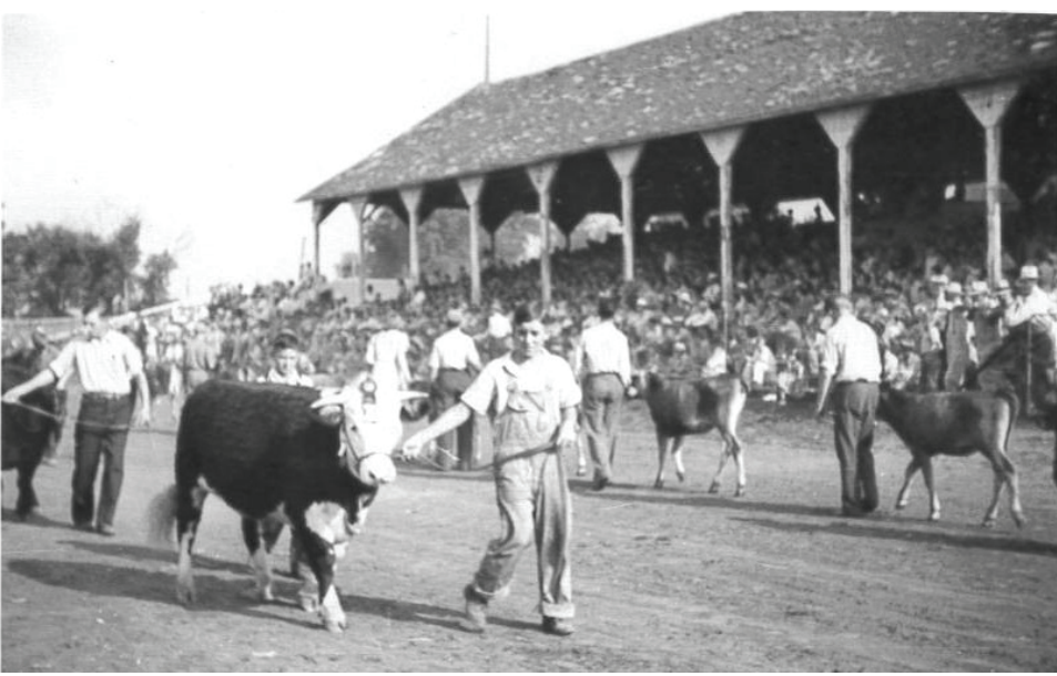
The 4-H Parade during the 1939 Farm & Home Bureau Picnic.

To place ads in the Bulletin or on the website, you must be a Knox County Farm Bureau member. Call 309-342-2036 or e-mail us at jreed@knoxcfb.org by the last Friday of each month to place the ad.