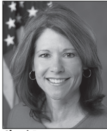
Cheri Bustos, Congresswoman, 17th District

Congresswoman Cheri Bustos represents the 17th District of Illinois. She is the granddaughter of a hog farmer, niece of dairy farmers, cousin of Angus farmers and all of her dad's side of her family grow corn and soybeans. She is a member of Democratic elected House Leadership and also serves on the House Agriculture Committee.